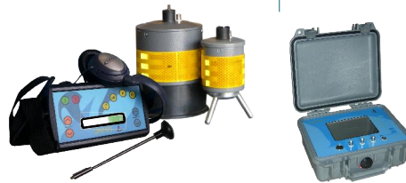
Optional : GMA105, PCA101

Surge Generators SG 200032, SG 130032, SG 50016, SG 7505 Cable Identification System CI75, CI200 Burndown Unit BU 3500 Ground Microphone Amplifier GMA105 Cable Reel System CRS30 DC Pressure Testers 2010PT AC Pressure Testers 3010PT Combination Pressure Testers (AC+DC) 5010PT, 7010PT, 10010PT, 3042PT VLF Pressure Testers VLF20 Fault Pre-Locators PCA101+AE101 Test Vans & Trailers Sheath Fault Locators SFL16